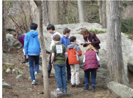
Youth Group Scavenger Hunt on April 7th